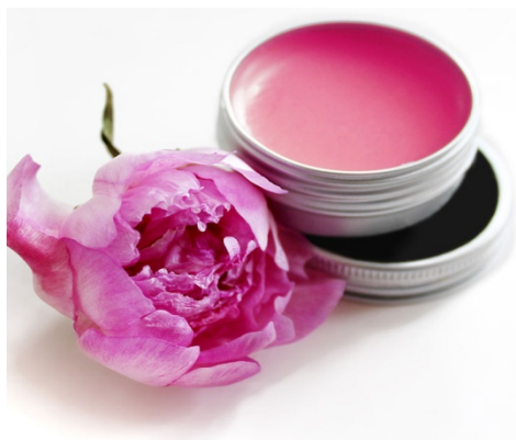
Figure 2: Purple Cabbage Lip Balm