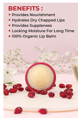
Figure 3: Pomegranate Lip Balm