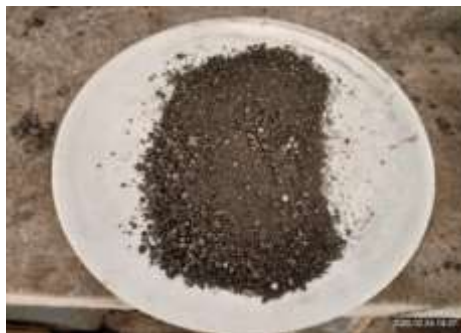
Fig 1 b.c.soil

The black cotton soil it is a core material of this project, this soil shrinks and swells in high moisture content region .The B.C.soil was collected from the place called as Bhalki. The shrinkage and swelling of an B.C.soil makes unsuitable for the load bearing of the heavy structures.