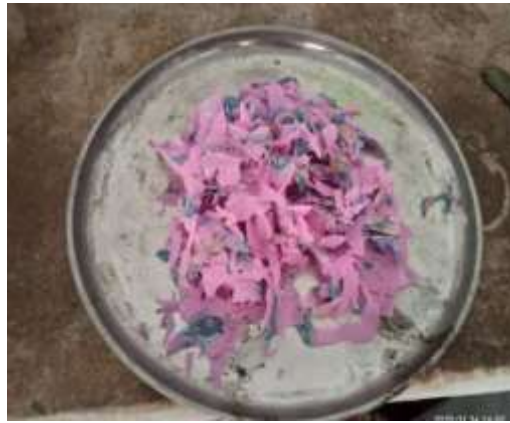
Fig 2 w.s.cloth